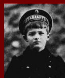
Alexis: Alexandra's Son with Hemophilia